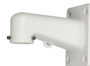
DH-PFB305W Wall Mount Bracket